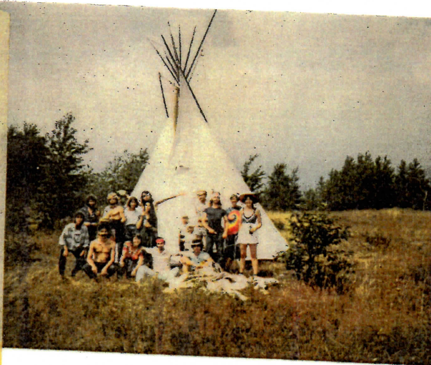
Almost 40 years ago 15 students paid $1,000 each for 278 acres of northern Adirondack farmland. Above: New Land Trust "settlers" and friends at a Poobah, their annual summer celebration.